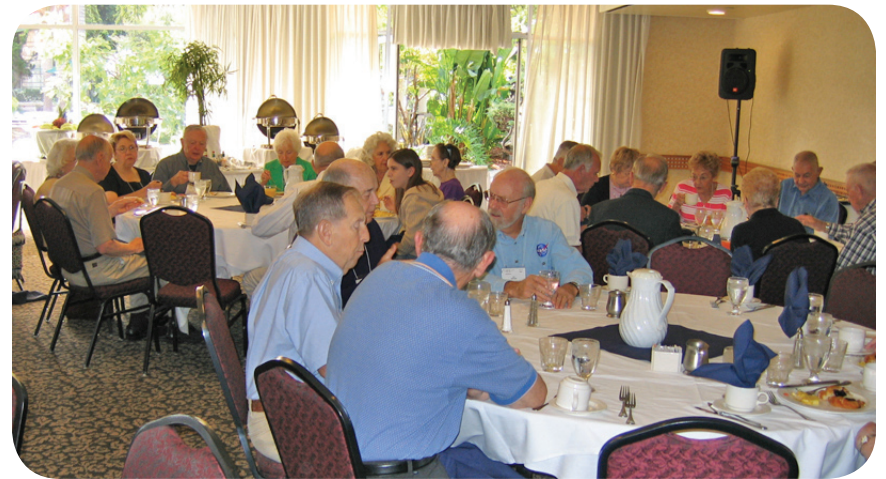
Another View of the Diners