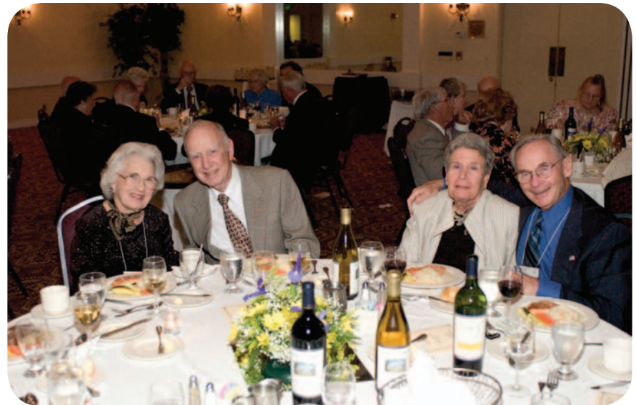
Ready to Eat