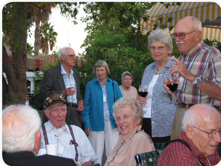
A Happy Group Following Up On The Winery Tour