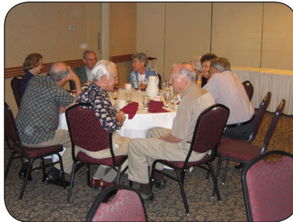
Serious Conversation Afterwards