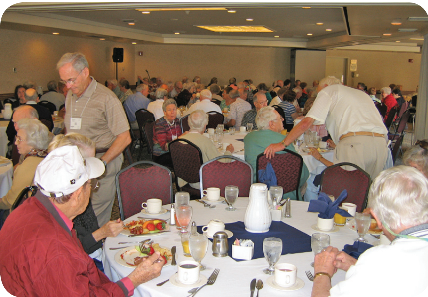
More of the Big Group