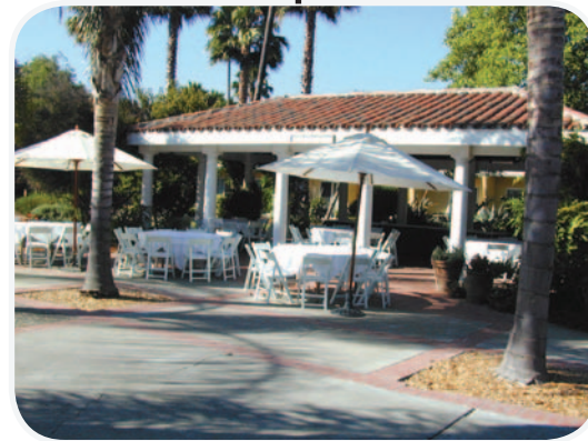
Friday Buffet Dinner