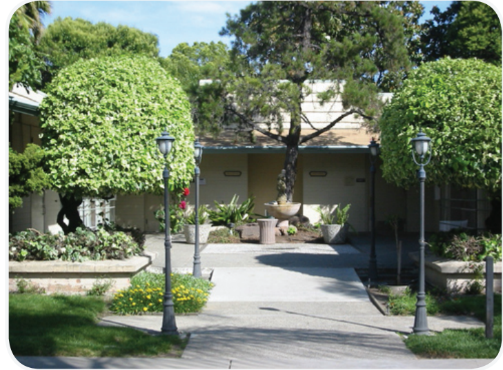
Governor's House (Hospitality Room)