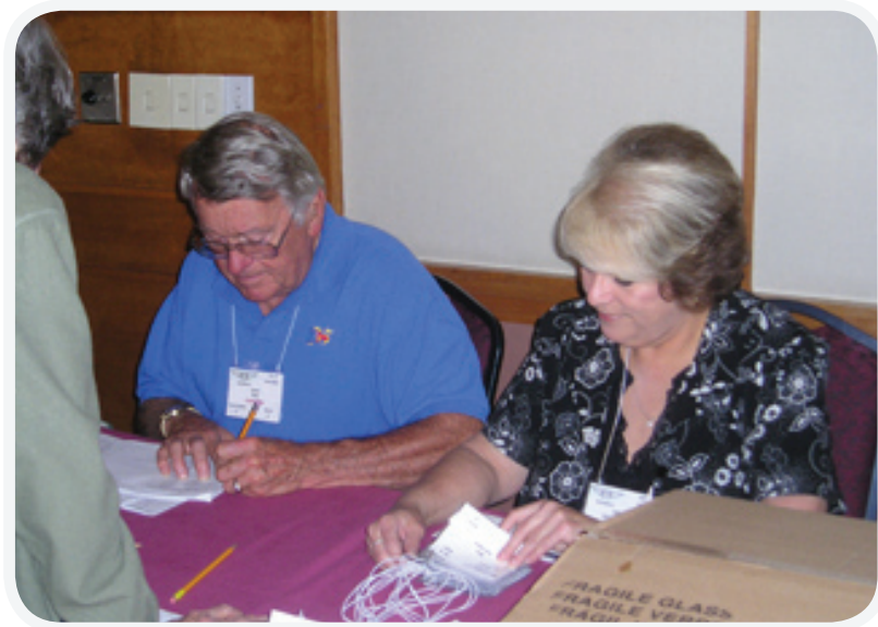
Quick, Find the Right Badge