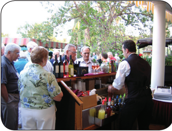
People Were Thirsty So the Bartender Made Money