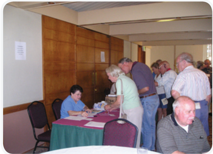
A Busy Time