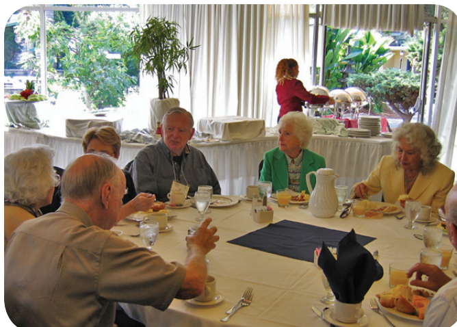
A Long Serving Table Was At Each End of the Room. The Views Out the Window Were Great, Too.

The Sunday morning Brunch was served in the Woodside Room. Despite being out late the night before, nearly 150 people convened on the patio in shirt-sleeve weather well before the 9 am serving time. The menu included sliced fresh fruits, ham, scrambled eggs, apple crepes, breakfast potatoes, danish pastries, orange juice and, of course, coffee and tea. There was a noticeable reluctance to bid farewell to friends and colleagues when it came time to return to the world of everyday living.