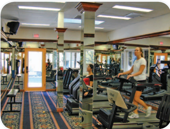
Exercise In Room of Mirrors