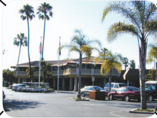
Hyatt San Jose