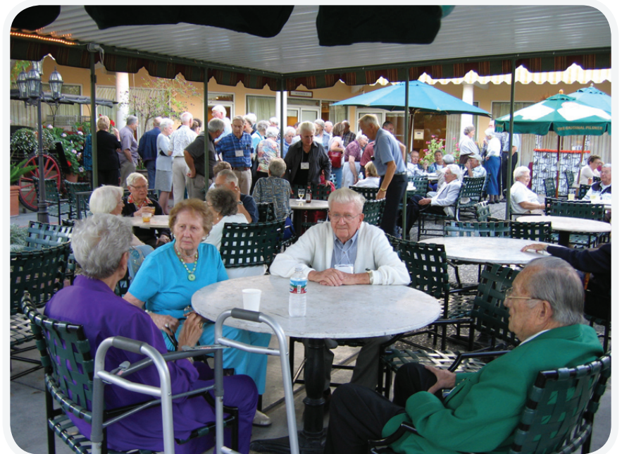
Looks Like a Serious Conversation