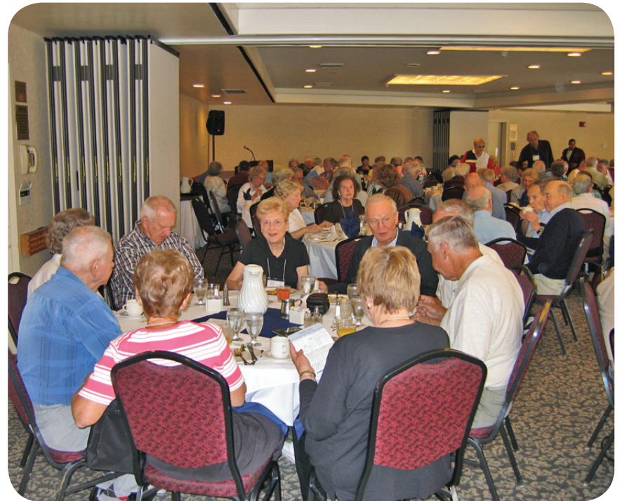
The Food Was Tasty