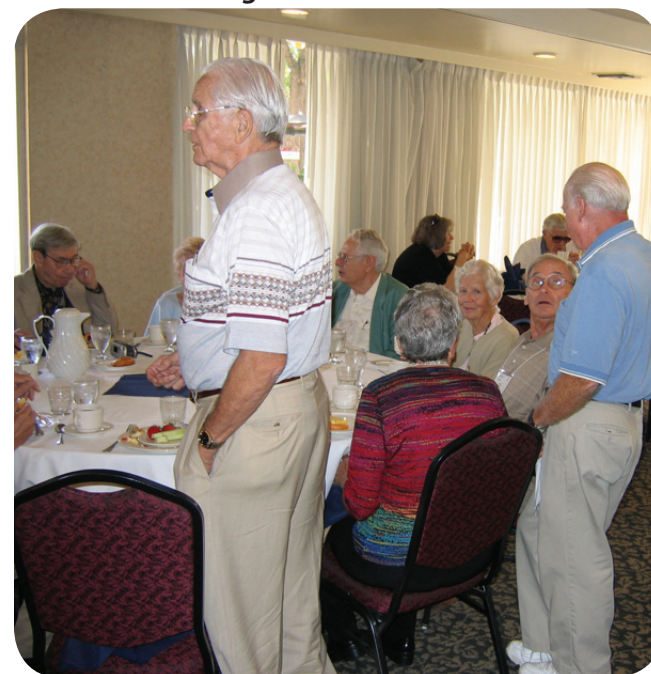
Well, "What Should We Do Next?"