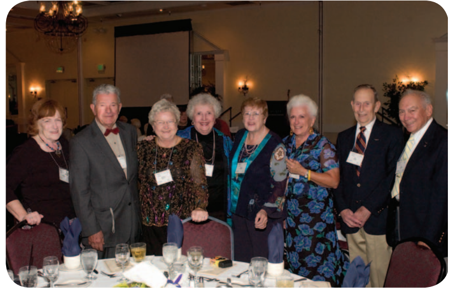
Part of Large Group From Lewis