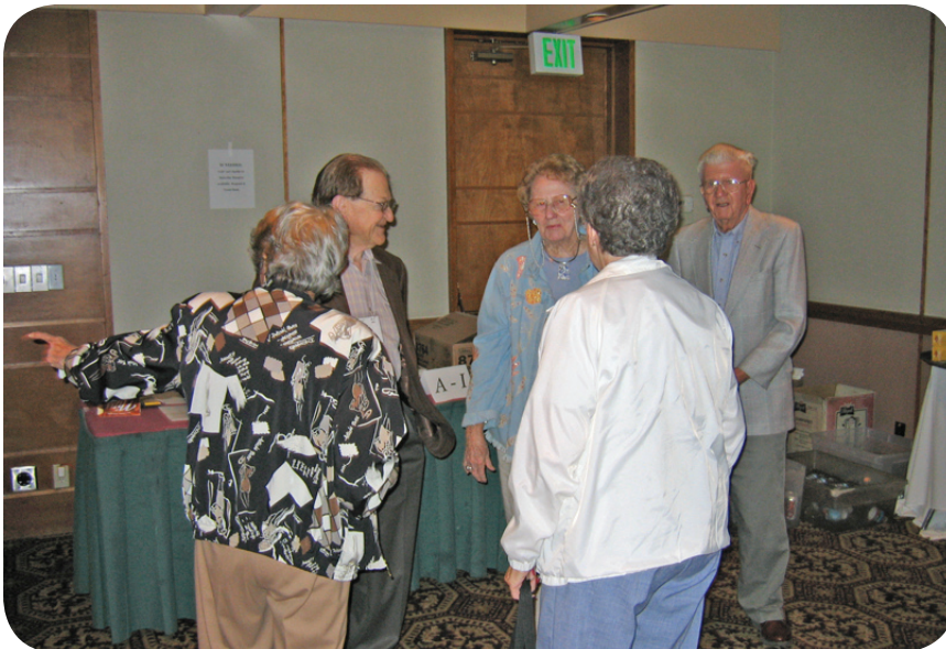
Go Over There and Turn Left