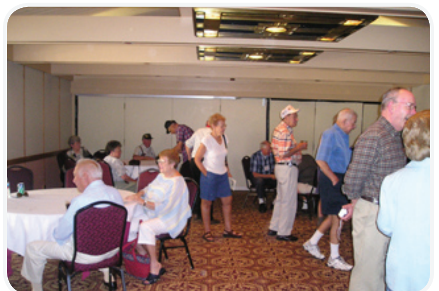
Lot's of Conversations