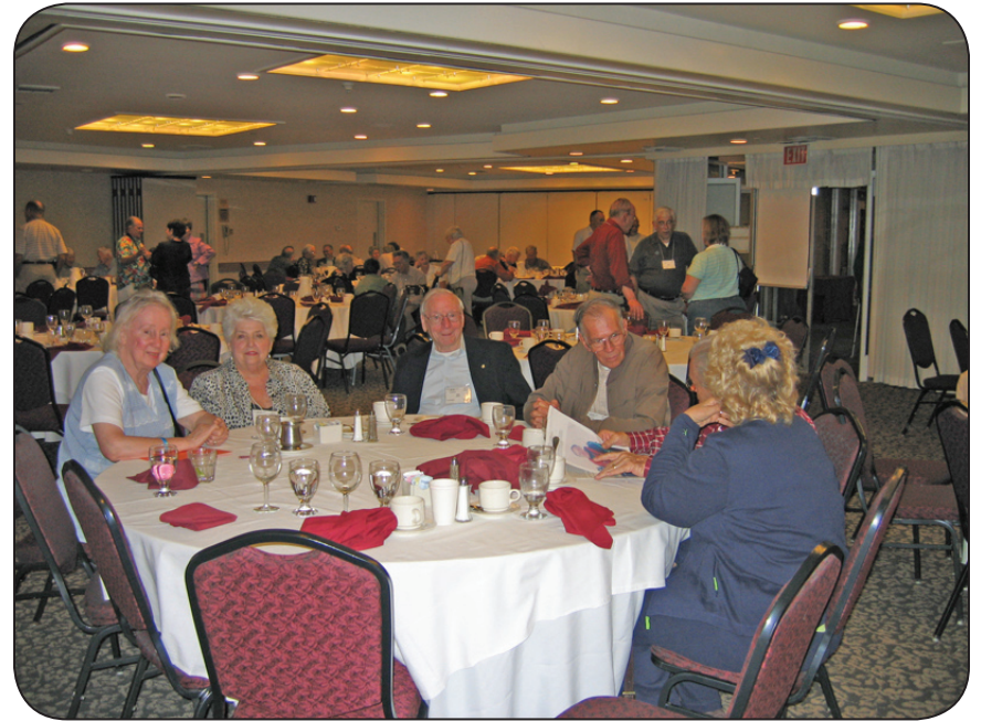
That Was Good - Now What?