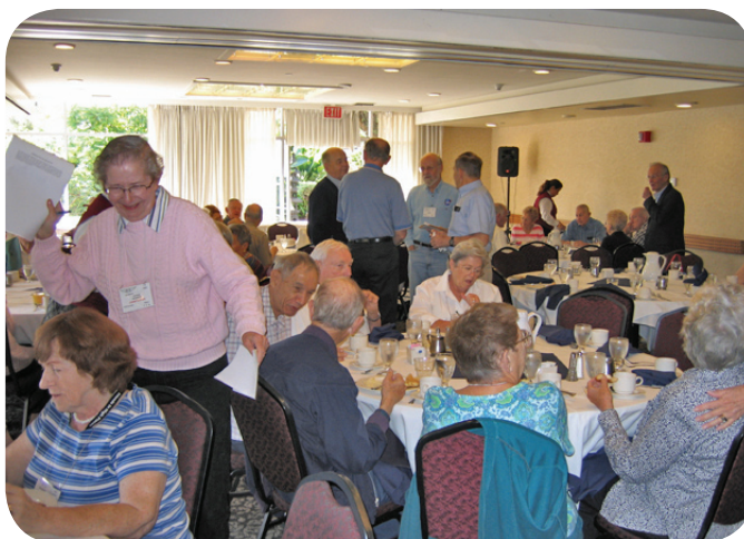
There Was No Shortage of Conversation