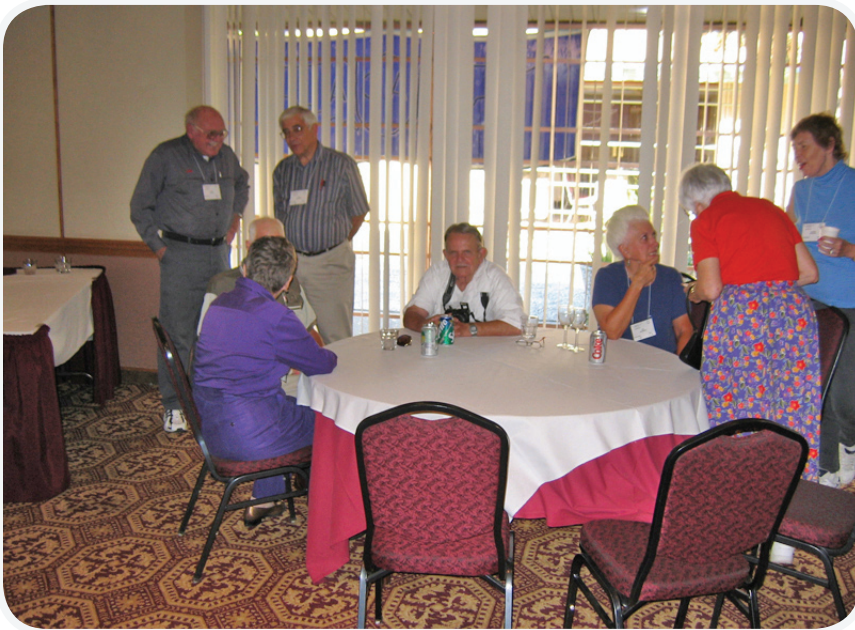
Time to Reminisce