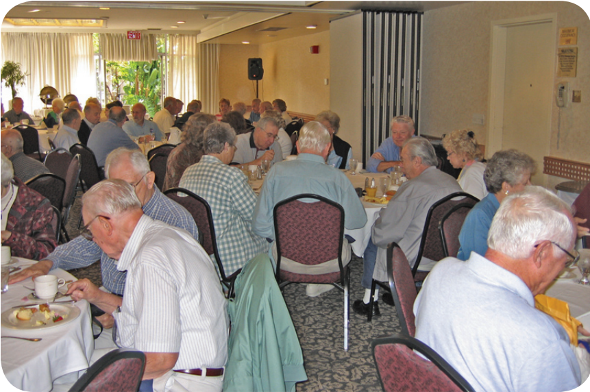
19 Tables Set For Brunch