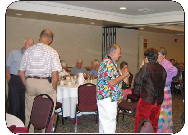
Now, the way I See It