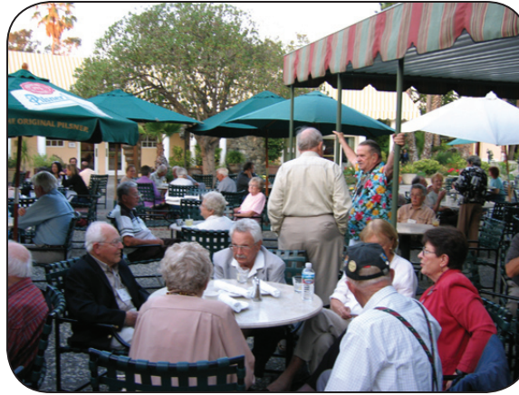
Everyone Gathered for Dinner and Enjoyed the Company