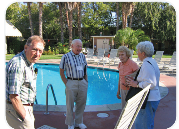
What Kind of Camera is That?