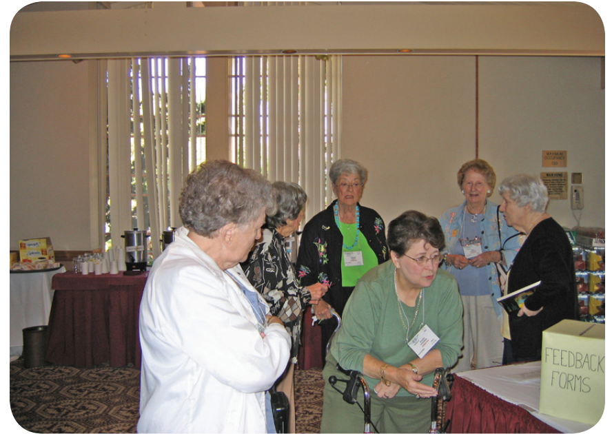
What's in the Box?