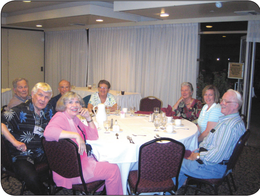
Smile (or laugh) at the Birdie