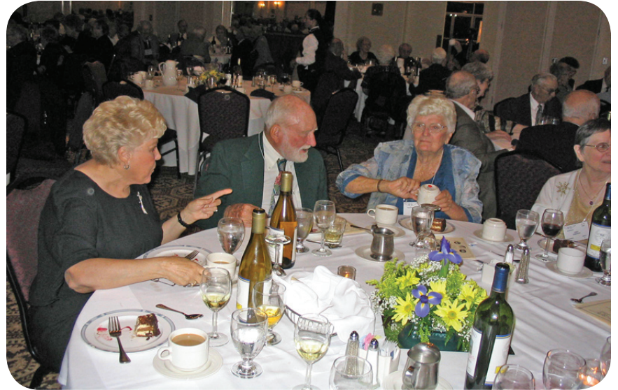
Look! I Won the Centerpiece