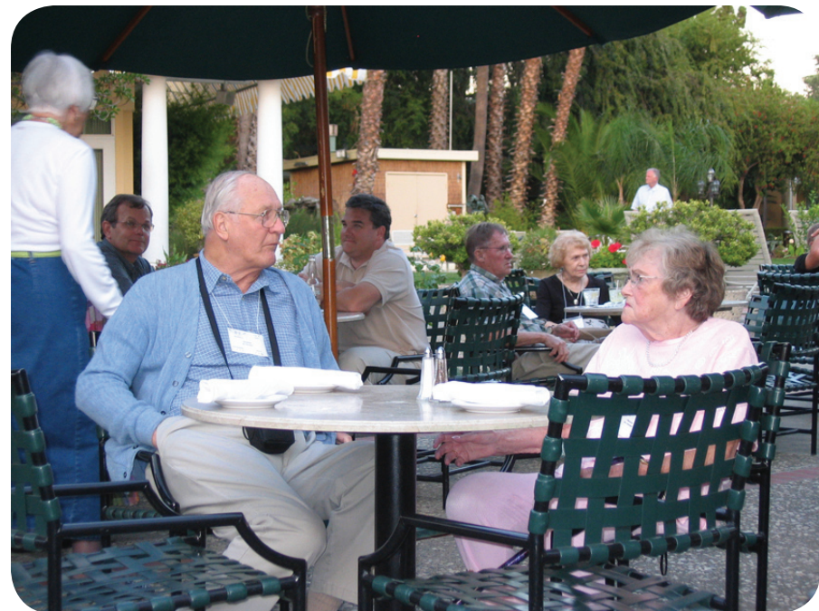
Enjoying the Warm Day