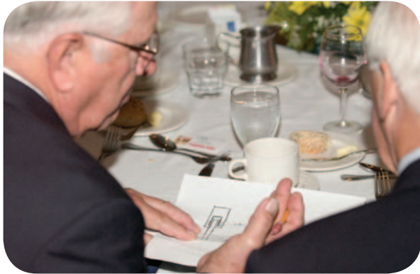
Engineers Are Always At It