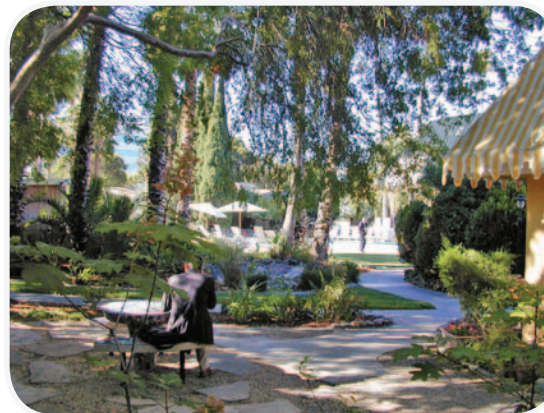
A Little Solitude