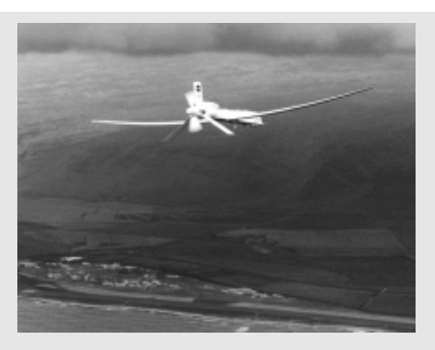
A remotely piloted Altus aircraft gathers data over the Pacific Ocean near the island of Kaua'i recently.

The climate studies are being guided by Sandia National Laboratories for the Department of Energy's Atmospheric Radiation Measurement--Unmanned Aerospace Vehicle program. The Altus was built by