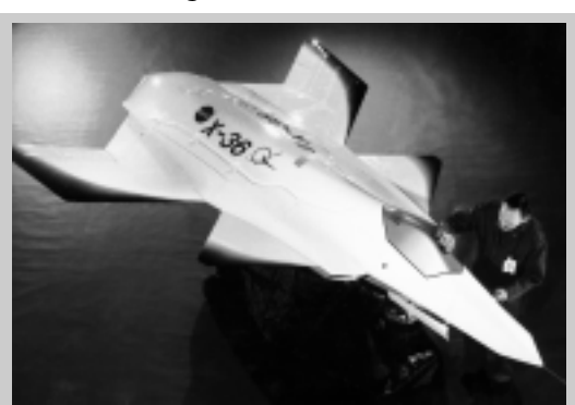
Subscale prototype (28%) of the model NASA/Boeing X-36 Tailless Fighter Agility Research Aircraft

The award recognizes design engineers who have made outstanding technical, educational or creative achievements that exemplify the quality and element of engineering