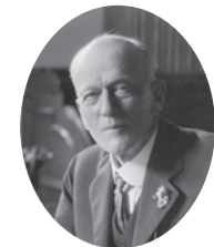
Charles D. Walcott 1919-1927