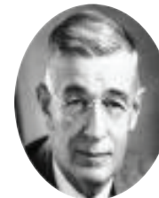
Vannevar Bush 1939-1941