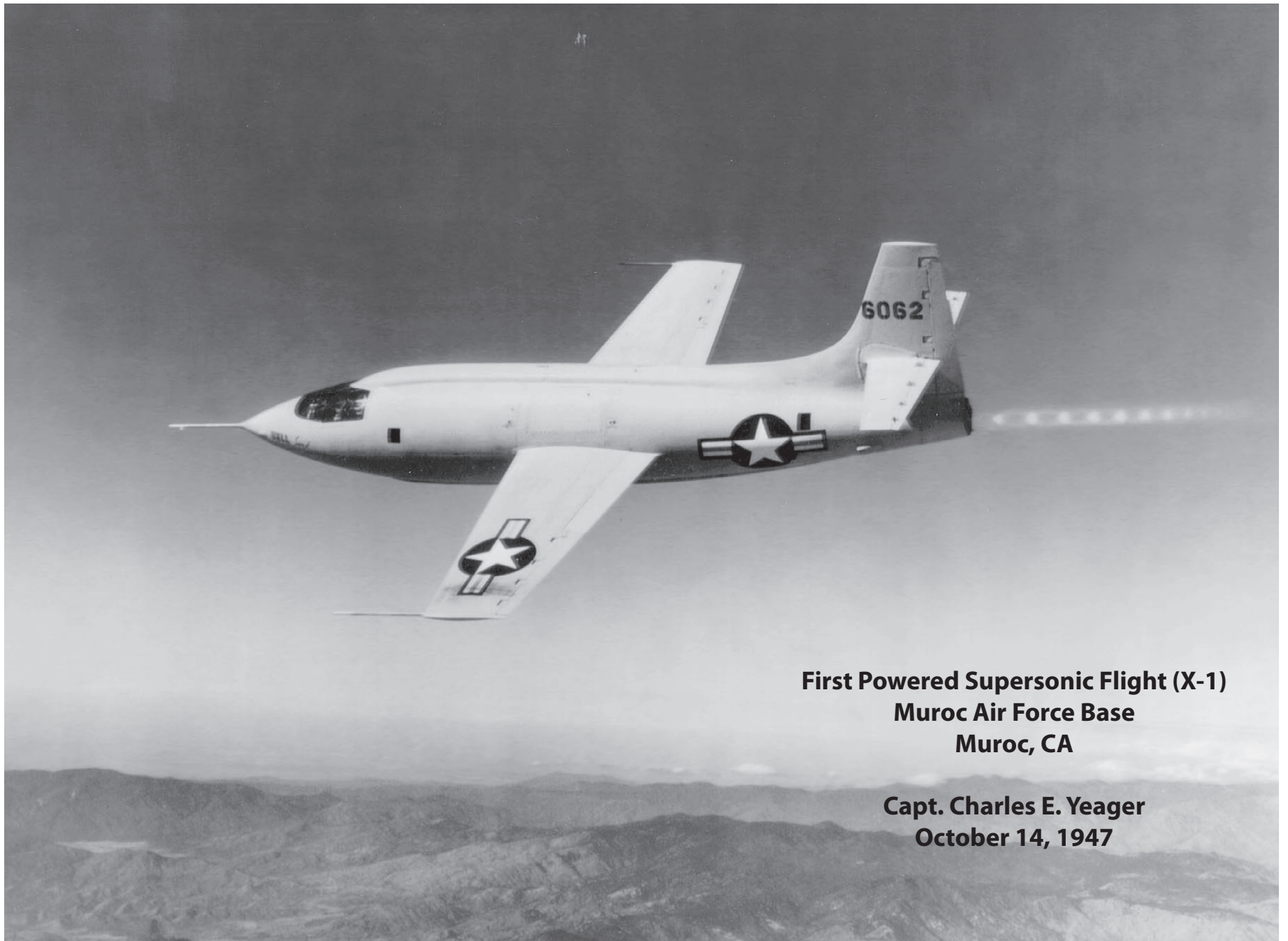
First Powered Supersonic Flight (X-1) Muroc Air Force Base Muroc, CA

Capt. Charles E. Yeager October 14, 1947