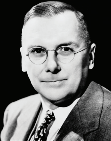
Dr. Hugh L. Dryden Director, NACA 1949-1958